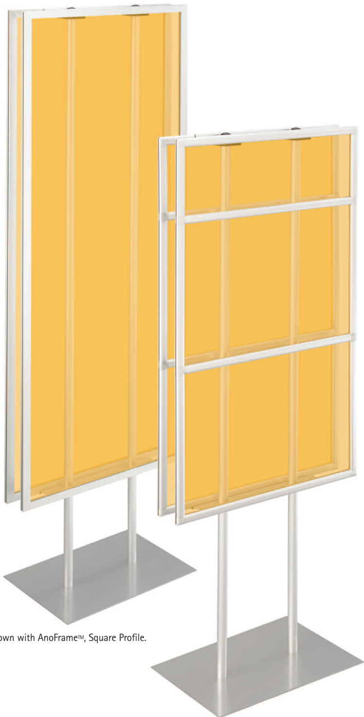
Shown with AnoFrame™, Square Profile.