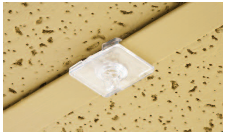
RAN-MM works with a variety of hooks and features a swiveling component for perfect graphic orientation.