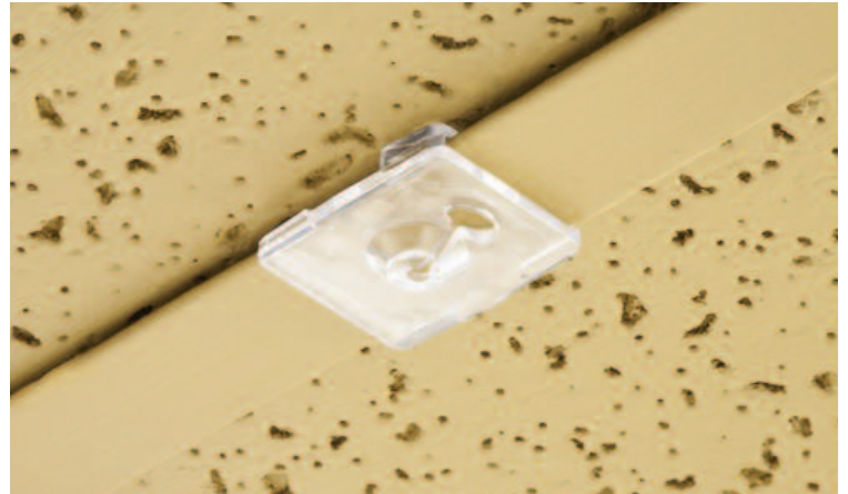
RAN-MM-CC works with cable and saucer and ball chain.