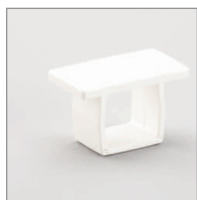
06-5485 EasyGlide Replacement End Caps for Plaster Ceilings Silver or white 2 End Caps are included with each plaster ceiling track.

EasyGlide Track System patent number: 8,070,122 Suspension Mount is patent-pending.