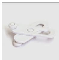
25-0018 EasyGlide Glider White or silver Unique design makes it easy to add or remove gliders as needed.