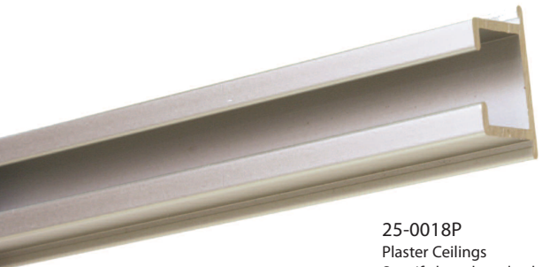
25-0018P Plaster Ceilings Specify length and color when ordering.