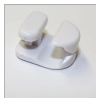
5RC-0036 Replacement EasyGlide Saucer Connectors. White or silver * For use with Rose Displays' saucer end cables only. Connectors included free with EasyGlide and Cable orders.