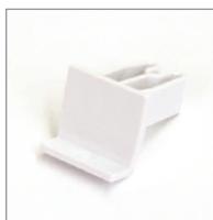
06-5800-W EasyGlide Replacement End Caps for Grid Ceilings White 2 End Caps are included with each grid ceiling track.