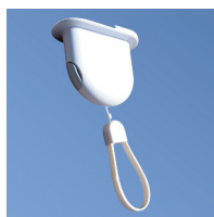
25-0042 ZipLine White

Easy-to-use loops are compatible with hole-punched substrates or graphic holders.