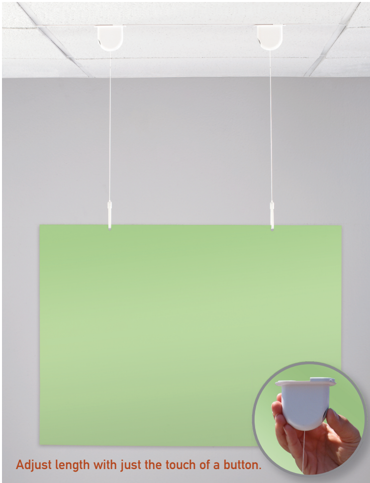
Adjust length with just the touch of a button.