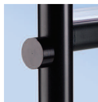
97-0303-BP puck knob black

* AnoGotcha Stand with Literature Holder available in 22" x 28" model only. Literature holder holds 8.5" x 11" printed material.