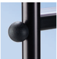
97-0303 round knob black