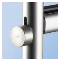
97-0303-AP puck knob clear anodized