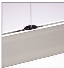
06-5050 Cable Clip Black or clear