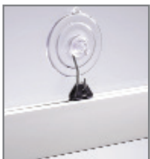
06-SC150H Suction Cup Clear with nickel plated steel hook