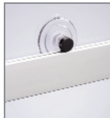
20-0038 Window Mounts Clear with black or clear cap