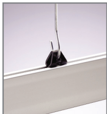
1UP-0101 MultiClip Black or clear